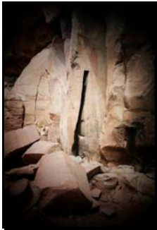
Shattered yet Whole

The resolution of these compound complex painful imprints holds a promise of healing within, instead of a fixing or a numbing of the feelings one experiences surrounding the event. Moreover, one usually does not really feel their own feelings, but rather they experience their feelings through other's images and explanations. When one has suffered severe terror in their life the ability to feel becomes frozen in time and space, even though time and space are only an illusion. The pain is real and so is the frozen non feeling within the individual. They are not non feeling by choice, but because of the deep psychological damage that has occurred, a human temporary safety mechanism.